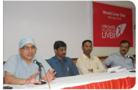
World Liver Day, Global Hospitals, Hyderabad (page 2)