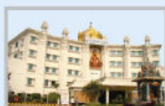
Global Hospitals, L.B. Nagar, Hyderabad