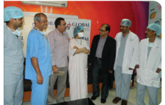
India's second ever single lung transplant performed at Global Health City, Chennai (page 3)