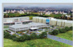
Global Health city, Chennai