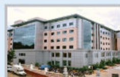
BGS Global Hospitals, Bengaluru