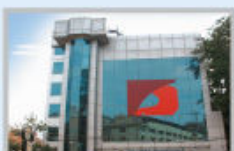
Global Hospitals, Lakdi-ka-pul, Hyderabad