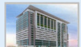
Global Hospitals, Mumbai